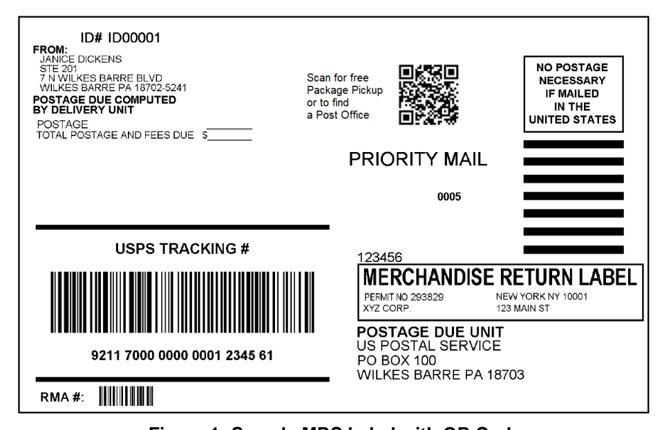
Figure 1: Sample MRS Label with QR Code

Merchandise Return Service (API=MerchandiseReturnV4) – Reference section 2.4.2.1 - Priority Mail (displayed below), First Class, and Ground Merchandise Return Service labels will be updated with a QR Code.