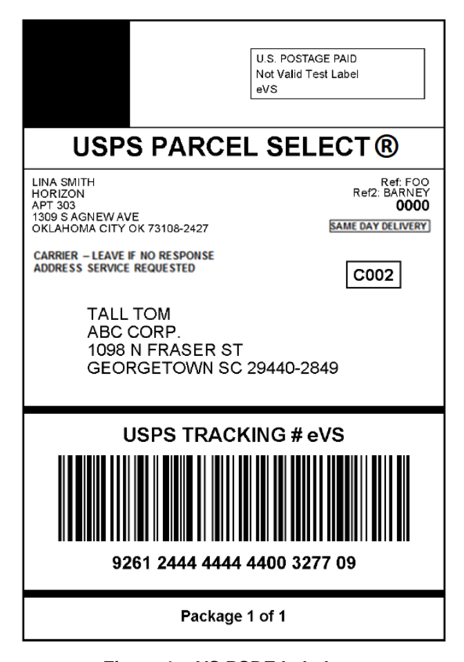
Figure 1: eVS PSDE Label

Reference June 2021 Release section 2.7.1