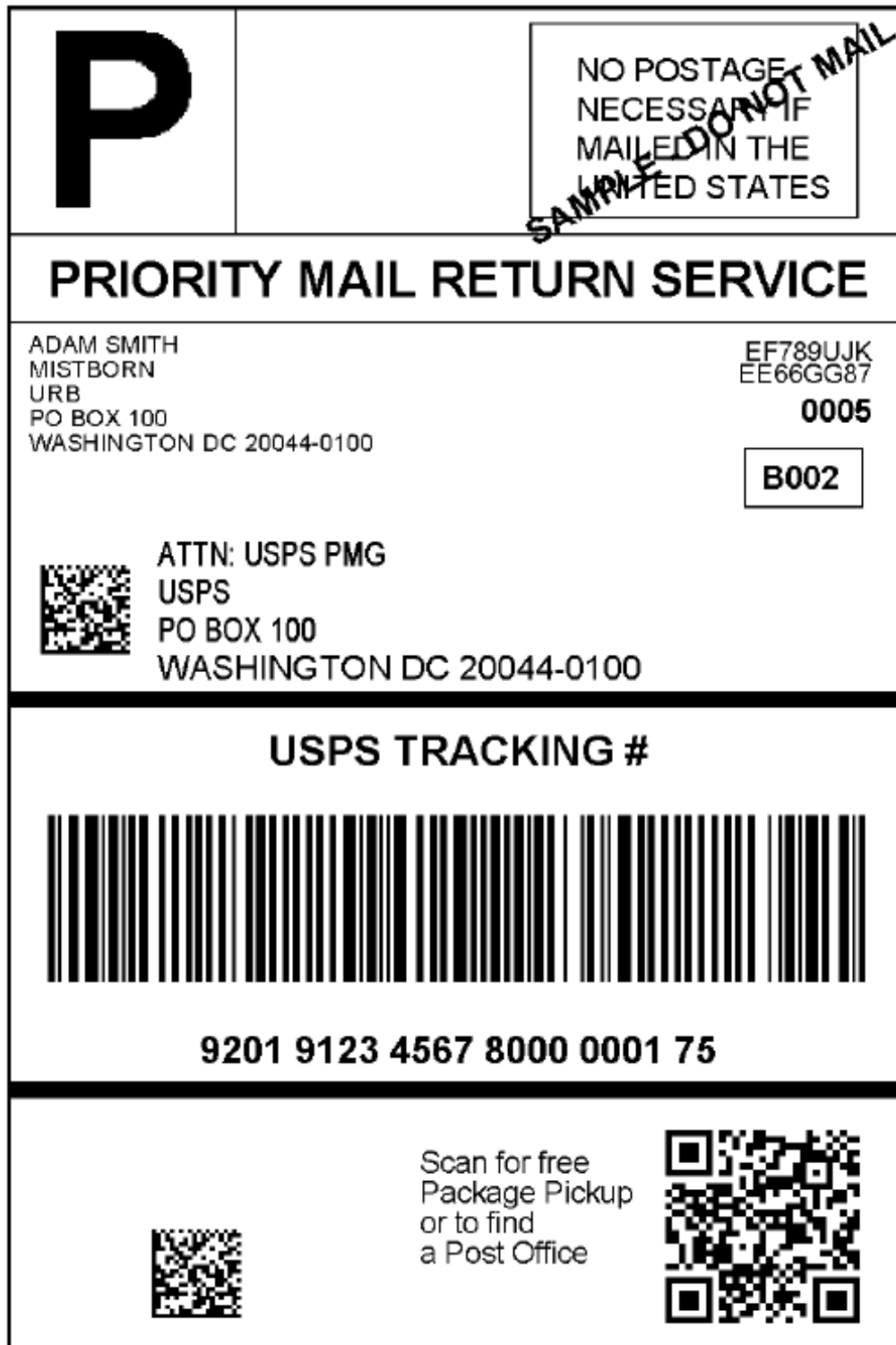
Figure 1: USPS Priority Mail Returns label